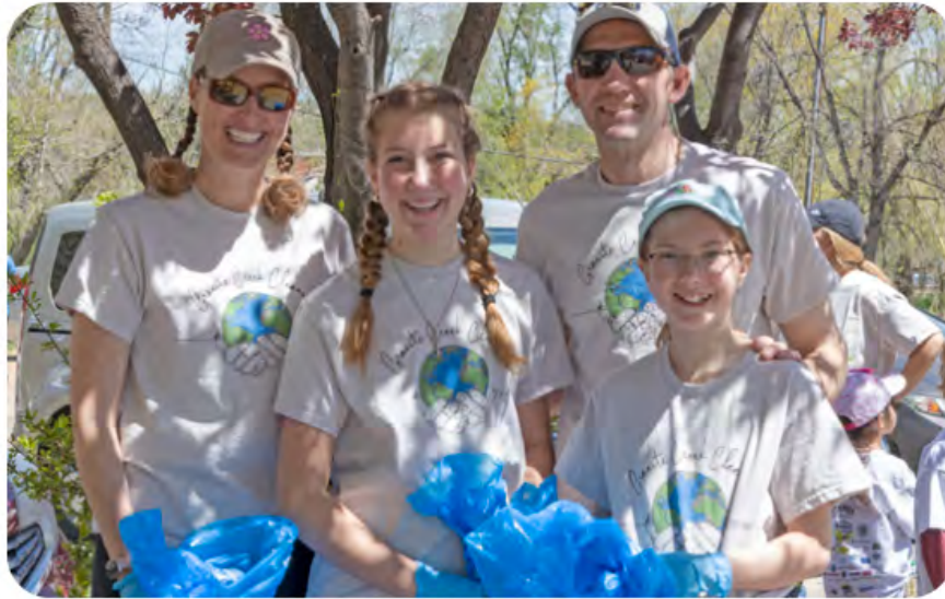
2023 family participating in the Granite Creek Cleanup.