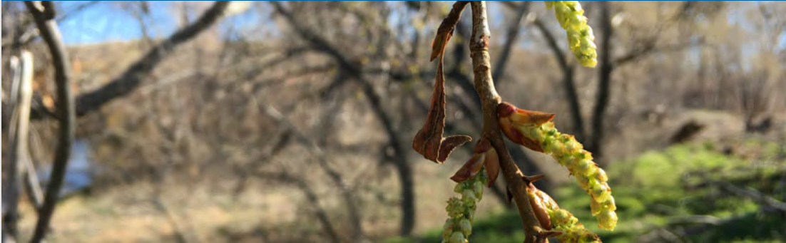
March catkins along Granite Creek.