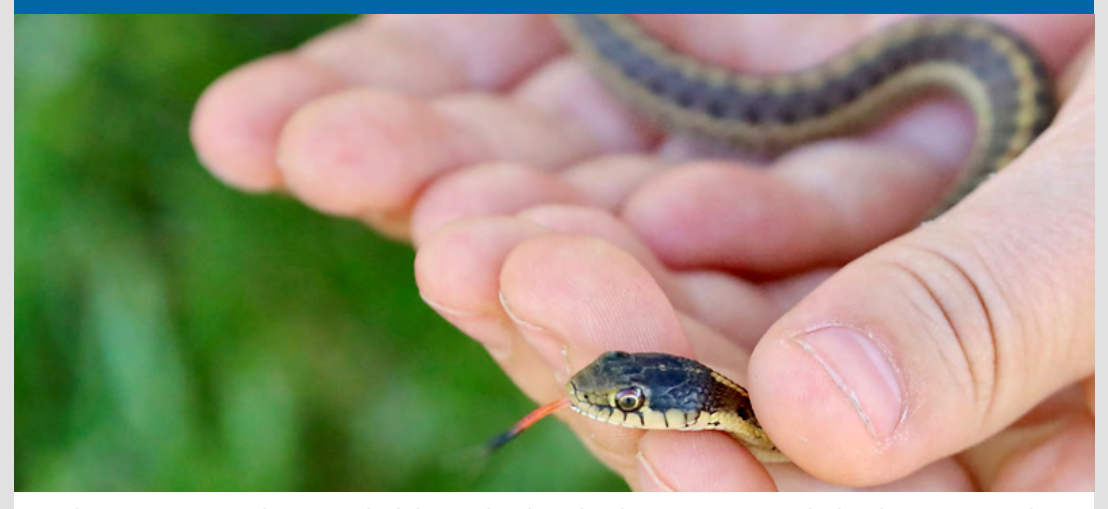
The Western Terrestrial Garter Snake ( Thamnophis elegans ) is the most common snake found at Watson Woods Riparian Preserve. The snake pictured here is nonvenomous and was encountered in Granite Creek Park. Note its orange tongue!