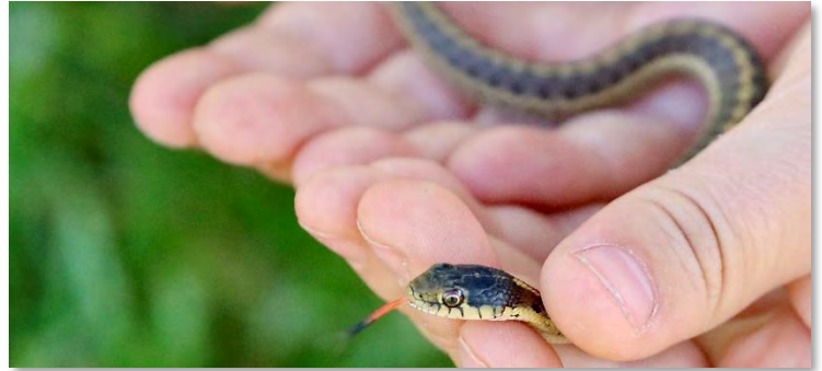
The Western Terrestrial Garter Snake ( Thamnophis elegans ) is the most common snake found at Watson Woods Riparian Preserve. The snake pictured here is nonvenomous and was encountered in Granite Creek Park. Note its orange tongue!