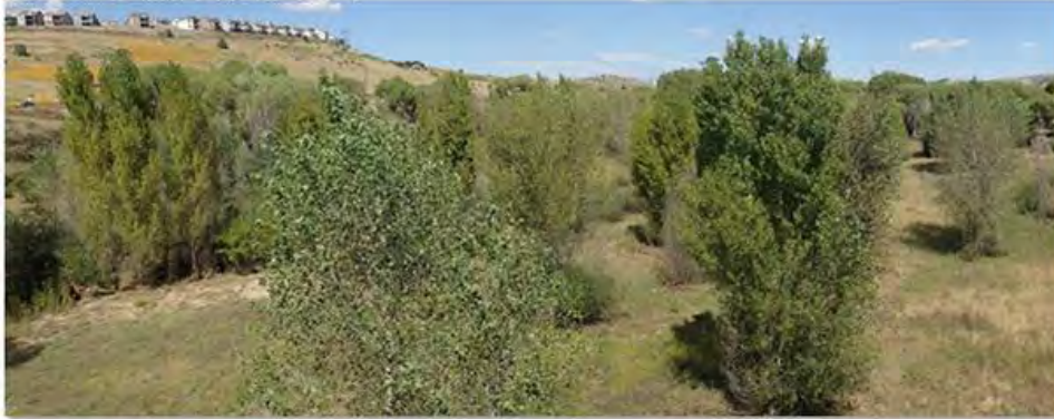
SEPTEMBER 2022 - GRANITE CREEK