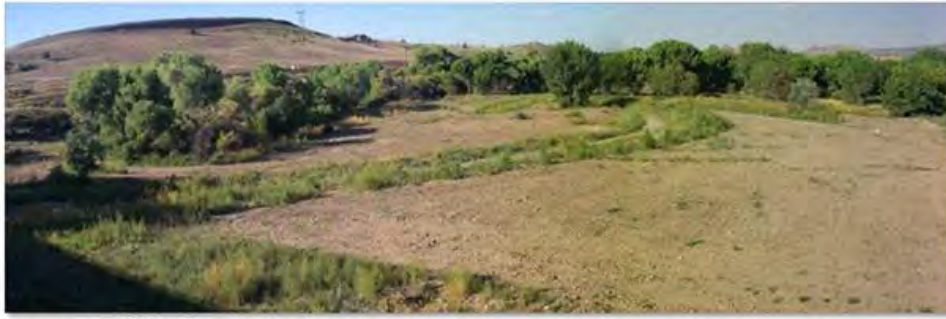
SEPTEMBER 2009 - GRANITE CREEK