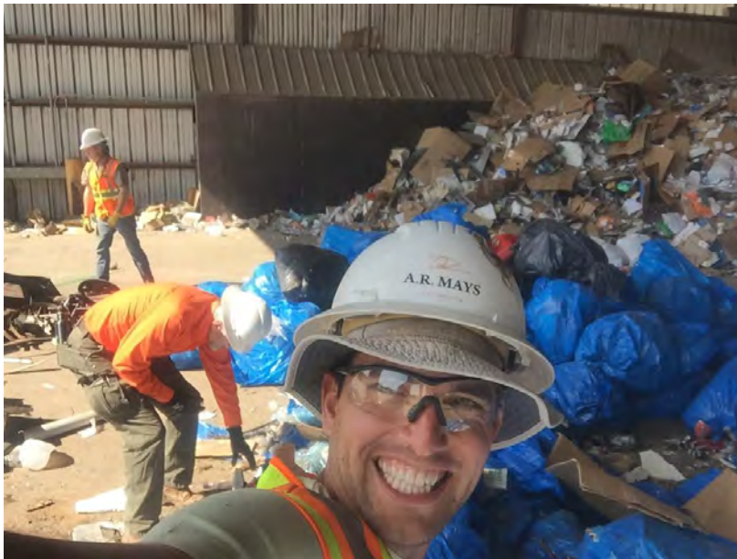
The 2022 Cleanup Audit begins (Note material in the background is household recycling - not Cleanup related)