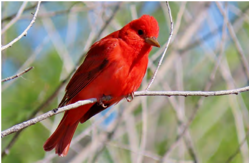
Summer Tanager watching over the Cleanup at Watson Woods Riparian Preserve