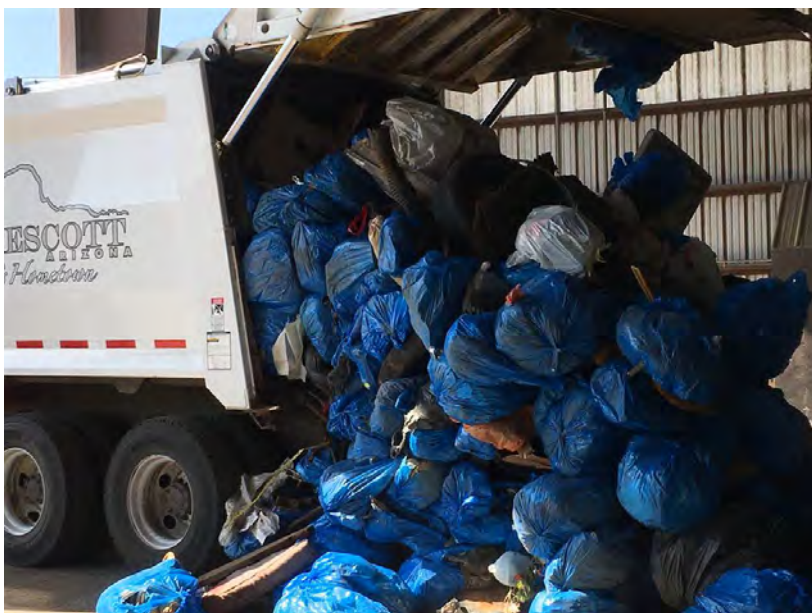
1.83 Tons of trash, debris, and tires arriving at the City of Prescott Waste Transfer Station