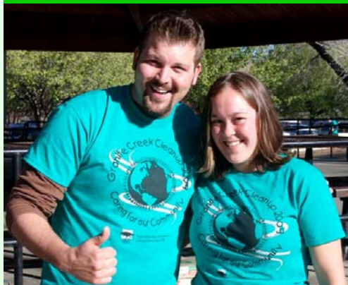
Volunteers

Prescott Creeks is proud to announce the 16th annual Granite Creek Cleanup and our fourth year organizing this important Prescott tradition!