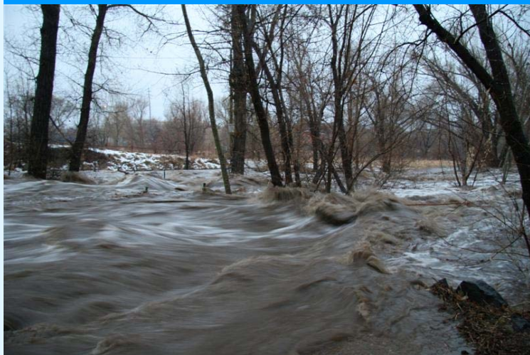
Granite Creek on January 21, 2010.

2010 is starting off with a splash. The creeks are flowing and the lake level is up. These past few weeks have been a demonstration of how important it is to care for our creeks and riparian areas.