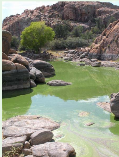
Willow Lake algae. September 2009.