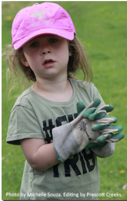
Future conservationist ready for work!

Additional goals for the coming year include Phase II Restoration efforts in the Preserve, Prescott Creeks' 14th presentation of the Granite Creek Cleanup, and ongoing water quality improvement projects with public and private stakeholders. The Miller Creek Public Restroom completed earlier this year is an example of creative partnerships coordinated by Prescott Creeks to ensure clean creeks.