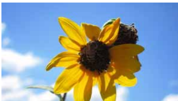
Look carefully at the heart of this Watson Woods wildflower

September. Hints of Arizona autumn. Nights are cool; "perfect sleeping weather" as some of our fathers and grandfathers would note as they opened the windows wide before bed. Birds and butterflies and other insects are in their latitudinal and elevational migrations. Prescott Creeks is stocking firewood to keep the log cabin office warm in the months ahead...and gearing up for our 25th Anniversary Event! 25 years of working to restore and protect our water quality, our waterways that in many ways define our community, and the surrounding natural areas so critical for those passing birds and butterflies. 25 years. Time does fly when you're having fun!