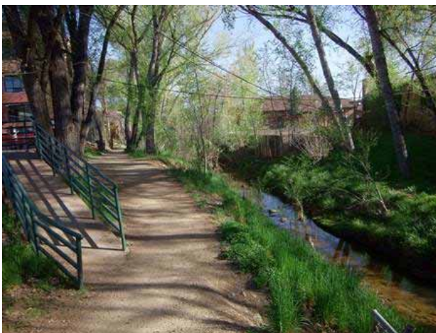
Granite Creek in downtown Prescott

Prescott's first Highlands Nature Festival is scheduled for September 11-12. Prescott Creeks, along with many other organizations and individuals, is looking forward to partnering in this event. Activities and guided tours and walks include a Prescott Creeks-led Urban Creek Walk highlighting the cultural and natural history of Granite Creek's scenic corridor through the heart of our city. For more information and registration, please visit the event website .