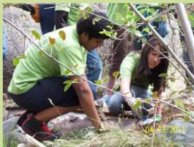
Volunteers in Acker Park

You can help Prescott Creeks in a number of ways. Consider becoming a member , making a donation , or volunteering on any number of projects designed to improve our community