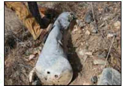
Water heater near Granite Creek in Watson Woods

The 2011 Granite Creek Cleanup will be held on Saturday, April 23rd . This year we are doing something a little different. The idea is to remove from the waste-stream the reusable trash that is collected and repurpose it