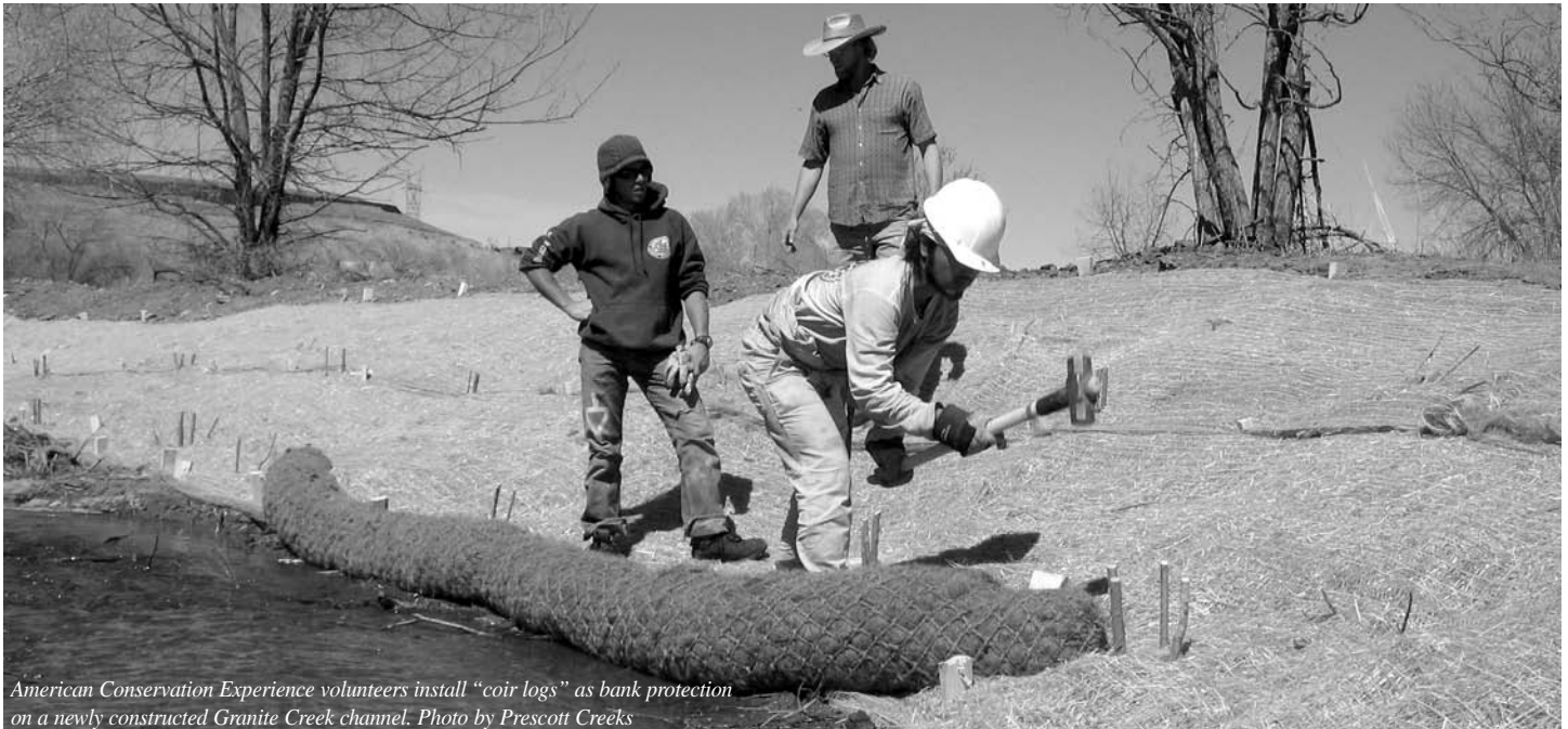
American Conservation Experience volunteers install “coir logs” as bank protection on a newly constructed Granite Creek channel.

living environments. Community education and involvement are foundational components to the project success. For further information about the project or if you are interested in volunteering please contact Prescott Creeks by phone at (928) 445-5669 or by email at Volunteers@PrescottCreeks.org .