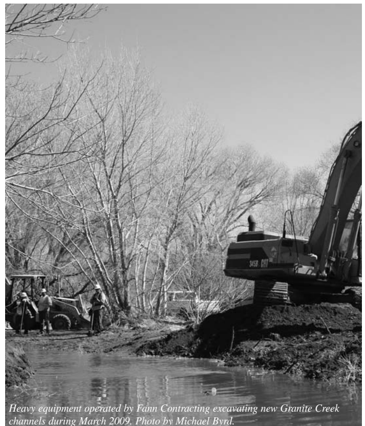
Heavy equipment operated by Fann Contracting excavating new Granite Creek channels during March 2009.

The Watson Woods Riparian Preserve Restoration Project is a habitat restoration and water quality improvement project. The goals of the project are to restore a more natural flow pattern for Granite Creek as it travels through the Preserve, reestablish existing habitats, create additional habitat and to monitor the effect these changes have on the living and non-